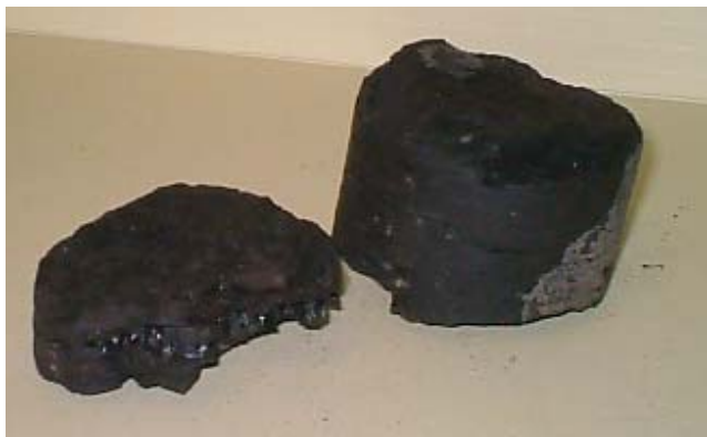
Coal and black shale