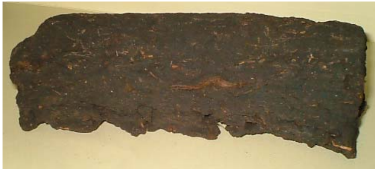
Swamp Peat - The first stage of coal