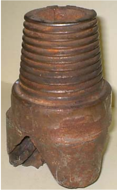
Small broken drill bit