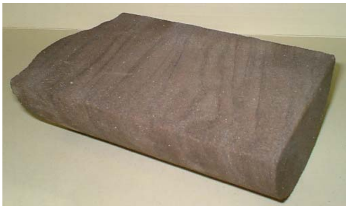
Slabbed Core - Glauconitic Sandstone which is oil bearing.